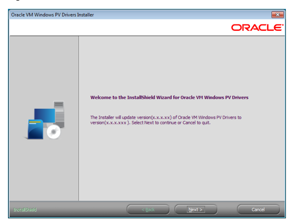
Figure 5.2 Oracle VM PV Drivers for Microsoft Windows installer window