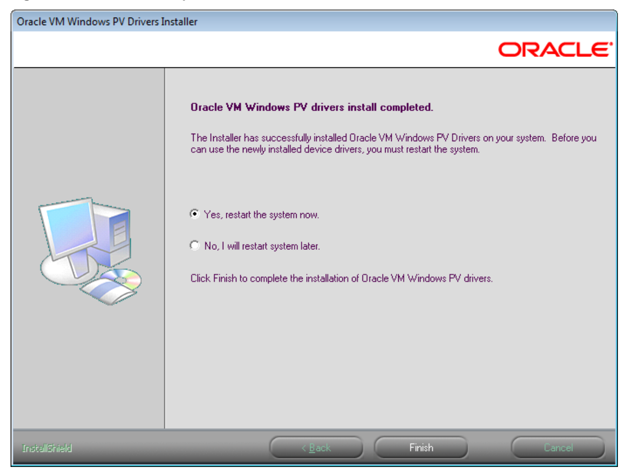
Figure 4.3 Installation Complete window

The installer copies the Oracle VM PV Drivers for Microsoft Windows files, and installs the drivers on the guest. The Installation Complete window is displayed.