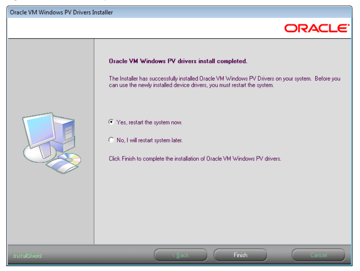
Figure 4.3 Installation Complete window

The installer copies the Oracle VM PV Drivers for Microsoft Windows files, and installs the drivers on the guest. The Installation Complete window is displayed.